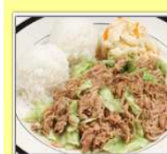
KALUA PORK & CABBAGE