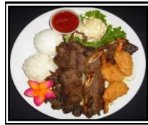
BIG ISLAND PLATE