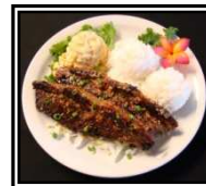
KALBI SHORT RIBS