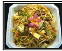
RAINBOW BEEF NOODLE