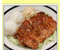
BBQ TERIYAKI CHICKEN