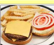
Teriyaki Beef Burger